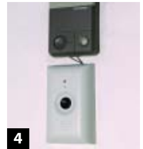
4 And pop the receiver unit onto the backing plate.