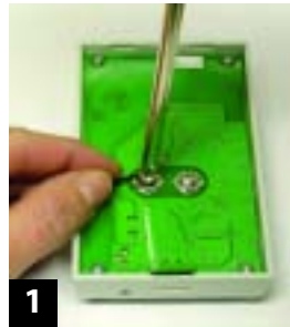
1 Attach "jumper wires" to the F2P receiver if you plan to retain your existing remote.

The F2P system uses digitally encrypted rolling code technology that emits a secure signal, with a limitless number of coding combinations thwarting break-in attempts. Additional transmitters can be installed in other vehicles and programmed to work with one receiver. The small, waterproof transmitter can be secured inside your motorcycle's headlight shell, under the fairing, or in another hidden location on the bike. Make sure to choose a location away from moving parts and excessive heat.