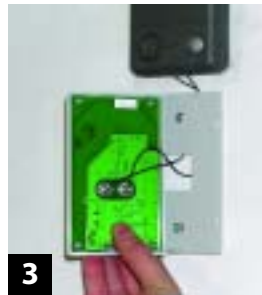
3 Mount the backing plate nearby.