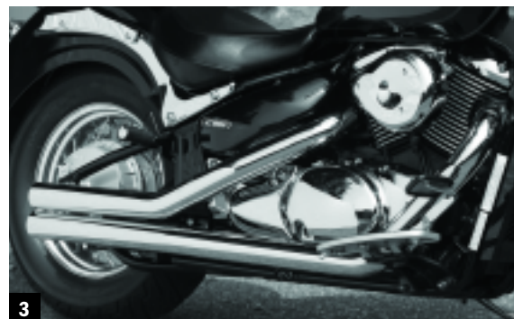
3 Ditching the big stock exhaust cans in favor of a new aftermarket system gave Phil's bike a sleek custom look. The Hard-Krome 2.5" Strippers exhaust gave the C50 a throaty growl. The supplied mounting bracket needed a little modification to properly line up with the exhaust system.

All RoadBike readers know that we couldn't let Phil head on down the road sporting a new free-breathing exhaust without also upgrading his intake system to reap the full benefits. It would just be plain irresponsible. All style points from the new accessories would evaporate every time he closed the throttle and Jiffy popped his way through deceleration. Imagine the shame!