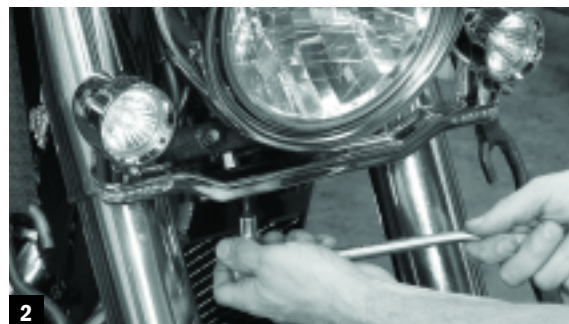
2 The Kuryakyn Driving Light Bar with signals cleans up the front end of the bike by replacing the stock turn signal stalks. The new signal lights are discreetly tucked into the lightbar mounting bracket for a thinner look. The projector beam lights pierce the darkness when winding down those country roads at night.