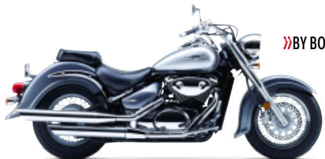
Stock Suzuki C50