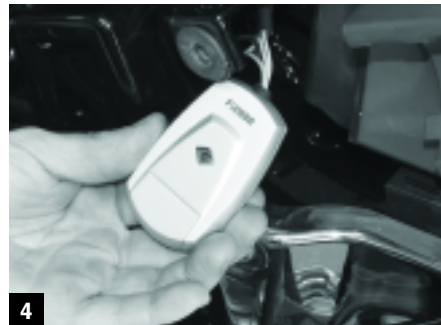
4 The C50's fuel injection module was upgraded with a Cobra FI2000R Fuel Management System for the right blend of fuel and air to best take advantage of the new exhaust.

All RoadBike readers know that we couldn't let Phil head on down the road sporting a new free-breathing exhaust without also upgrading his intake system to reap the full benefits. It would just be plain irresponsible. All style points from the new accessories would evaporate every time he closed the throttle and Jiffy popped his way through deceleration. Imagine the shame!