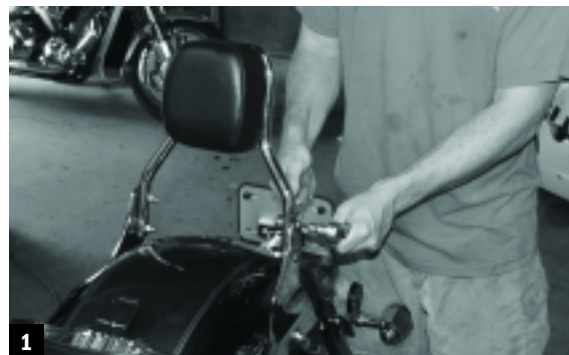
1 Phil Ercoli's wife is grateful for the new Suzuki Chrome Passenger Backrest Kit that gives her the extra comfort and support she needs for those long rides through the New England countryside. Phil uses the backrest to attach bungee cords when strapping things down to the seat. It bolted right onto the bike without a hassle.

So, finally, after many late nights of cold pizza and warm beer at the RoadBike think tank, we eventually agreed upon a package that would give the C50 a modest makeover and bump up the ponies, too.